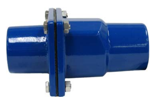
CV-2600A - Aluminum