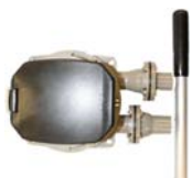
Top view of closed Trim Ring and Removable Handle