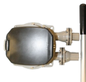
Top view of closed Trim Ring and Removable Handle