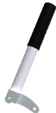
Vertical Handle & Actuator