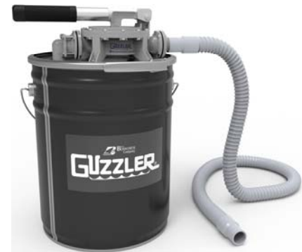
Available with optional steel pail with lever-locking lid